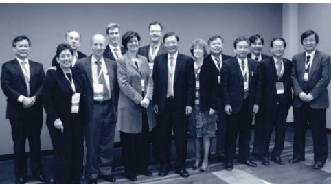
International panel meets during annual meeting of the RSNA to plan the Third World Congress of Thoracic Imaging which will take place in Seoul, South Korea in 2013.