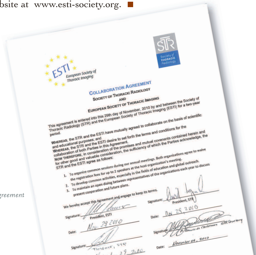
Signed collaboration agreement