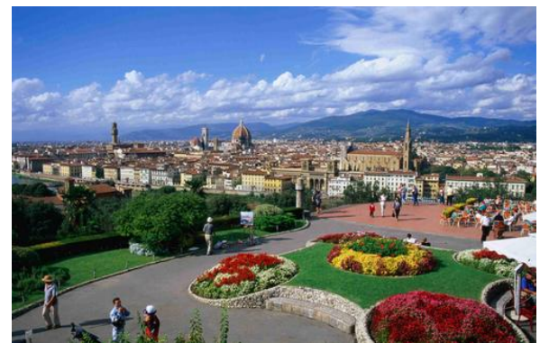
Piazzale Michelangelo and city of Florence

120 abstracts were selected for oral presentation in one of 18 scientific sessions to be held throughout the meeting. The remainder will be presented as posters on a daily rotating basis. Abstract notifications were emailed on February 1, as promised. If you submitted an abstract and have not yet received notification, please contact the WCTI organizing committee.