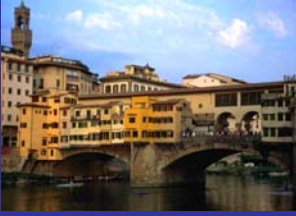
Famous Ponte Vecchio in Florence

Interested in increasing your participation in the STR?