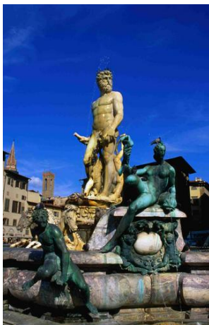
Neptune fountain in Piazza della Signoria. Superstition has it, that by a full moon, the figures at the base come to life!

Over 200 scientific abstracts were submitted for presentation at the World Congress. The quality of the submissions was quite high and the scientific session committee worked extremely hard to grade and select abstracts for presentation, given a very short turn-around time. Over