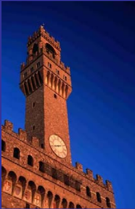
Torre d'Arnolfo of the Palazzo Vecchio